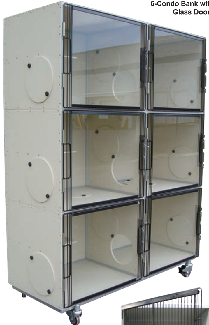
6-Condo Bank with Glass Doors