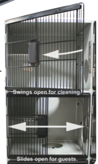
Swings open for cleaning